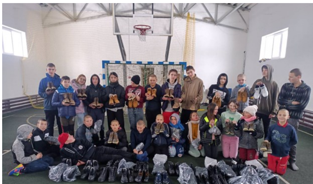
Fra børnehjemmet i Livchitsy