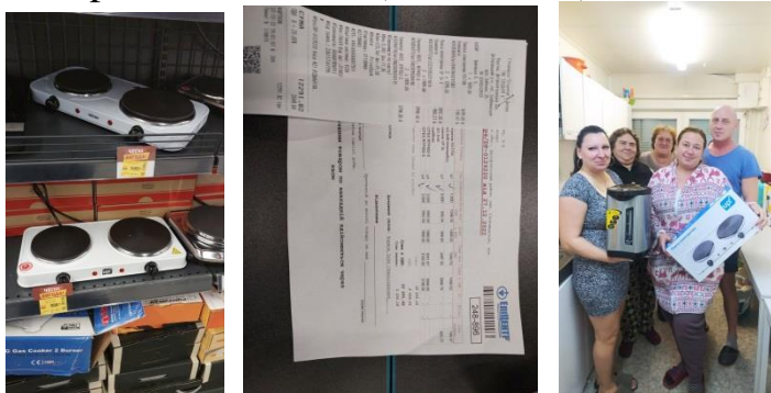
8. 4 thermoses for shelter (7 800 UAH)