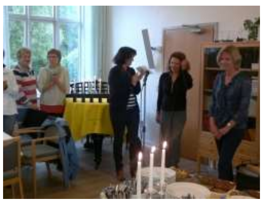
SI Odder had prepared a wonderful evening with soroptimist meeting,