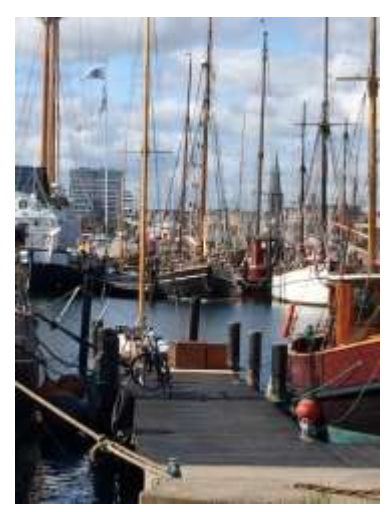
The harbour area