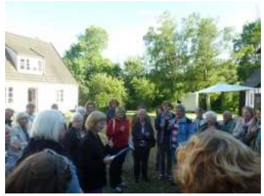
We were welcomed by SI Skanderborg in a farmhous. Each member of the club had made some of the food. Very delicious :)