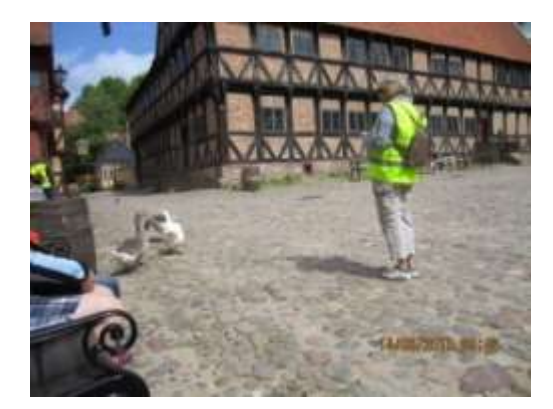
Meeting the geese in the street

After lunch we will walk along the beach in Aarhus to see Sculptures by the Sea , an exhibition of art in the nature where many Danish and foreign artists have built up special works of art.