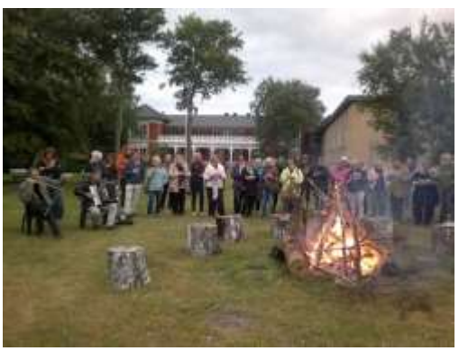
and a good time along the coast with music and song