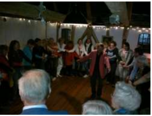
With the soroptimist host in the band we heard great folk music And the soroptimist husband could lead the dance for everyone