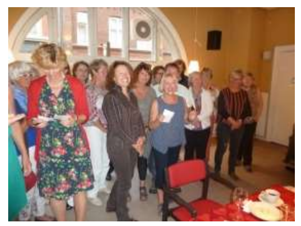
The more we are together.. The more we bike together... The more we smile together.. etc in many different languages. A warm goodbye after a great week :)