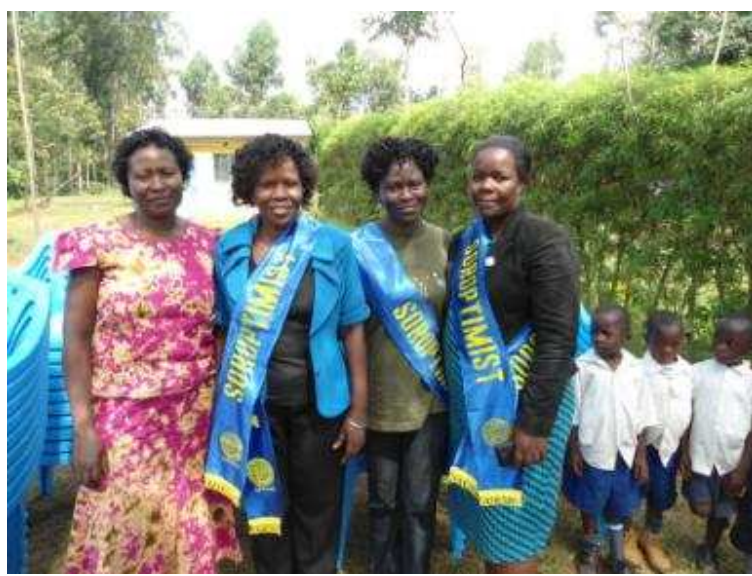
THANK YOU SI, AARHUS CLUB!